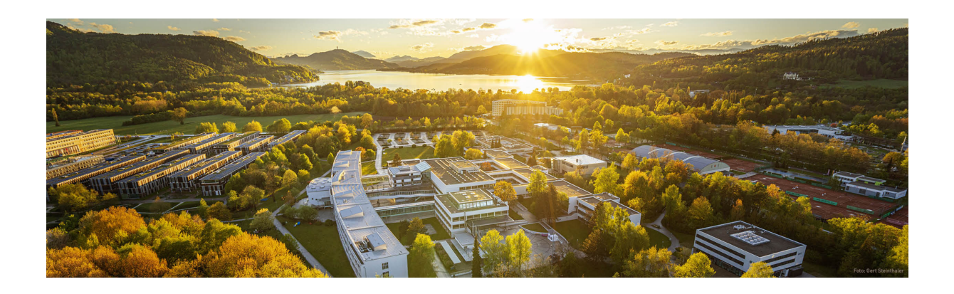
Wednesday 11 September 2024 - Friday 13 September 2024